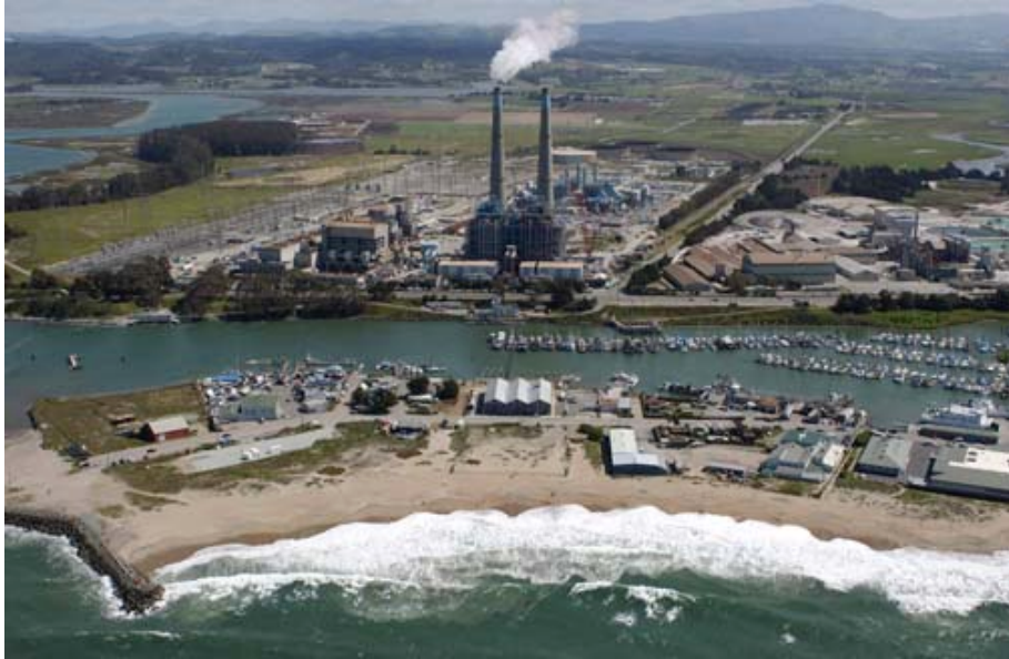
Moss Landing Power Plant/Cal-Am "test" Desalination Facility (December 2006)