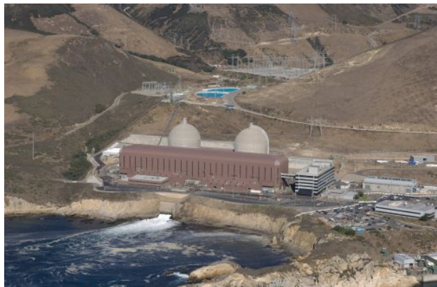
Diablo Canyon Nuclear Power Plant (December 2006)

ANY AND ALL REPRODUCTION OF THIS DOCUMENT IS ENCOURAGED AND FULLY PERMISSIBLE BY LAW IN THE INTEREST OF COASTAL PROTECTION AND PUBLIC PARTICIPATION