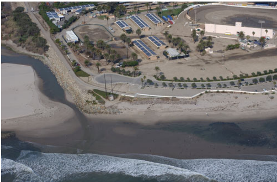
Ventura Surfer's Point Beach Restoration Project Area (November 2006)