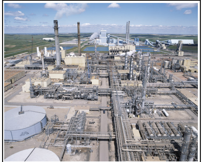
The Great Plains Synfuels Plant in North Dakota (pictured above) produces roughly the same amount of Coal SynGas proposed at the Power Holdings Coal SynGas plant.

Making synthetic natural gas from coal is extremely energy intensive - more than half of the energy needed to turn coal into gas is wasted, never reaching our homes and businesses.