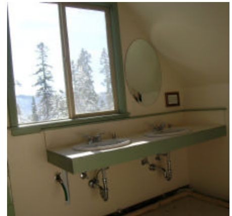
Men's dorm bathroom, 11/07