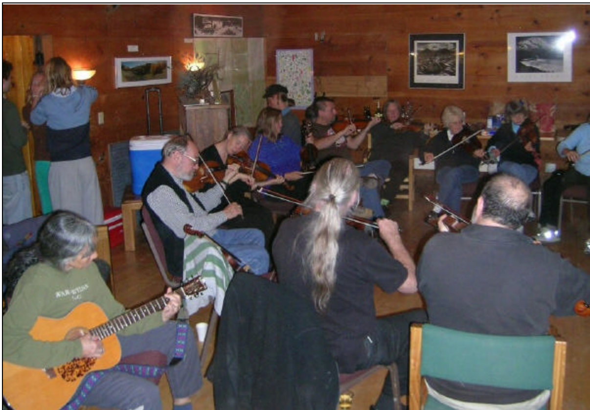
Fiddlers at the Lewis Clark Room.