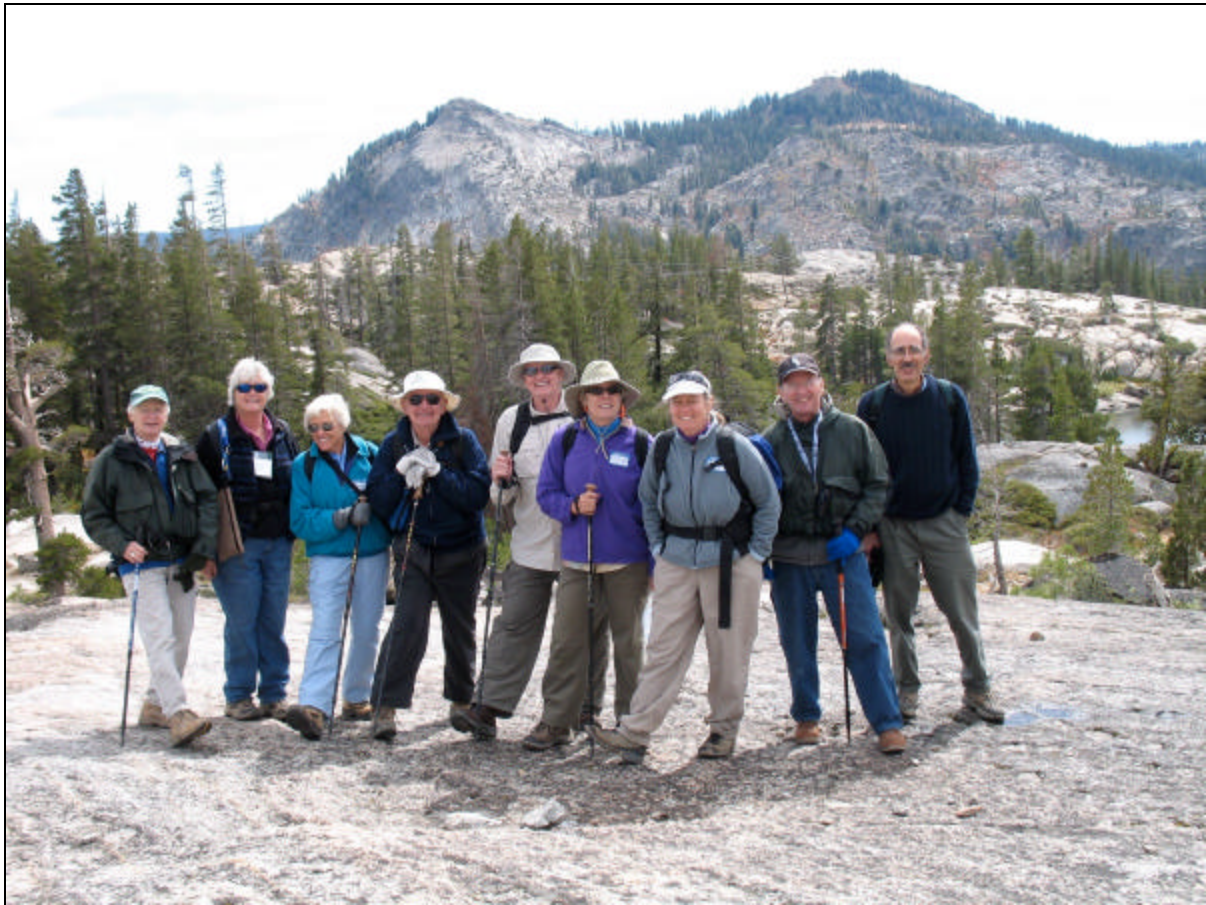
Participants in Treks and Trails, Tunes and Tales of the High Sierra.