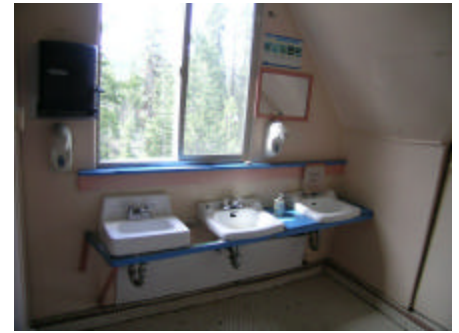
Men's dorm bathroom, 9/07