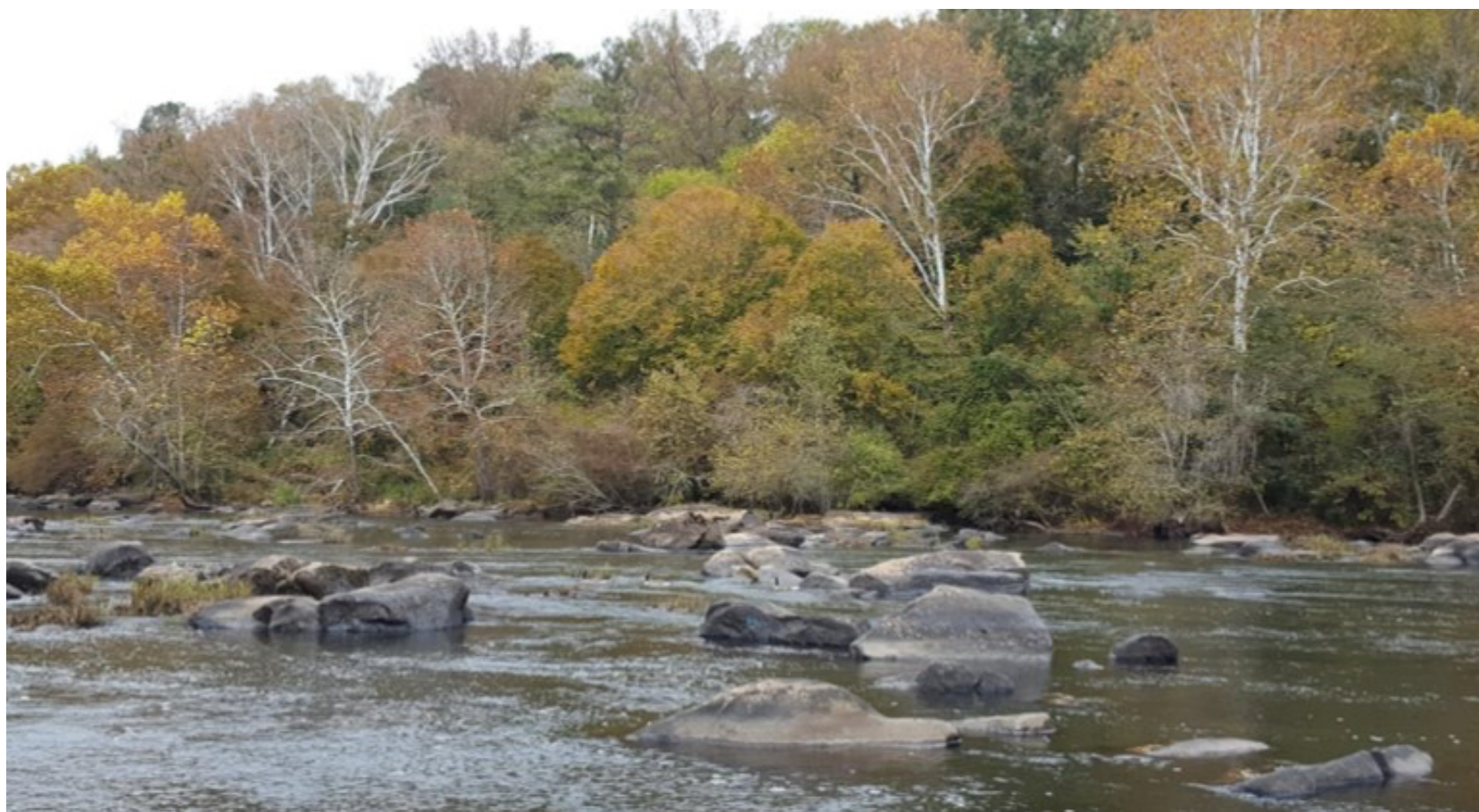
The beautiful falls of the Appomattox River from Ferndale Park in Petersburg.

10/8/22 9:30 am – 11:30 am FOJG Hike on the Lower Appomattox River Trail – Ferndale Park in Petersburg. We will hike the beautiful Lower Appomattox River Trail from Appomattox Riverside/Ferndale Park in Petersburg 1 - 2 miles upriver and then downriver for a total of about 4 miles. We can also explore the canal paralleling the river trail. Bring a picnic lunch if interested to eat after our hike. There is a 15 person limit. Register here .