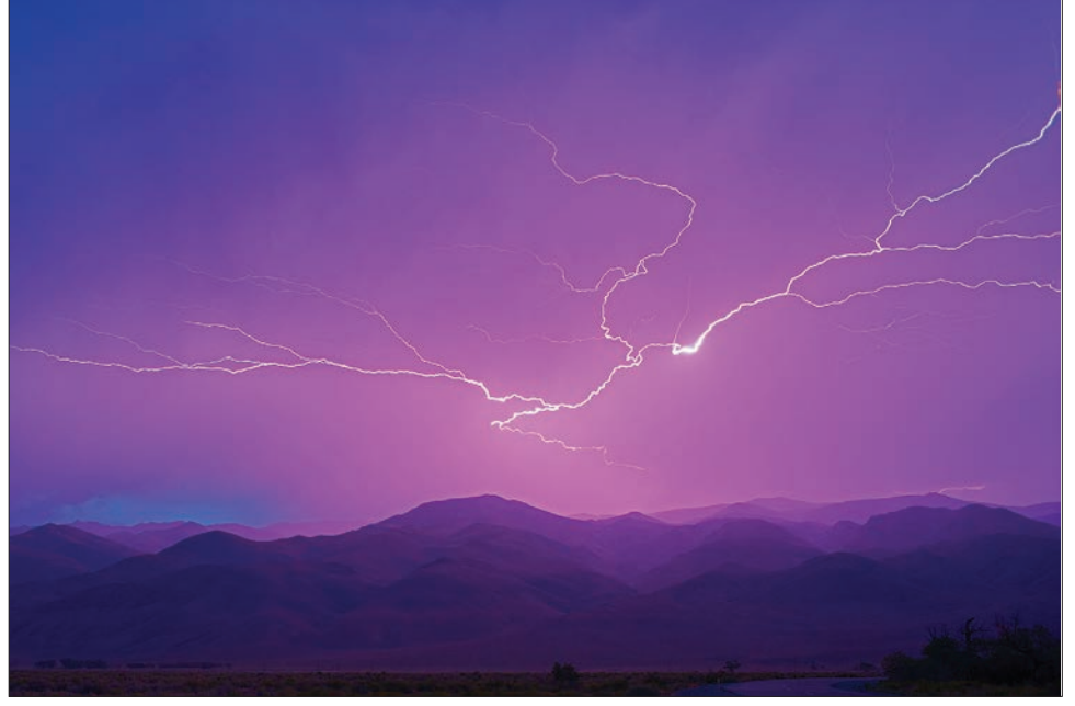
Lightning at sunset over the White Mountains.