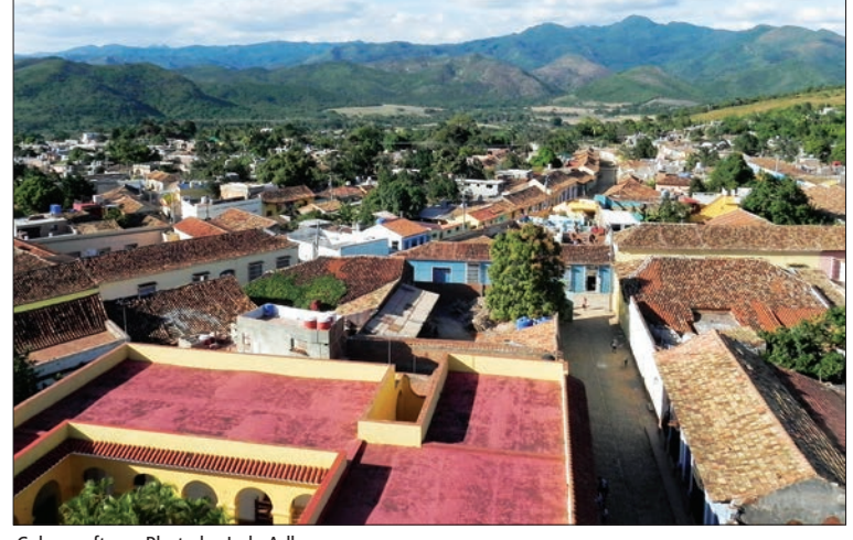
Cuba rooftops.