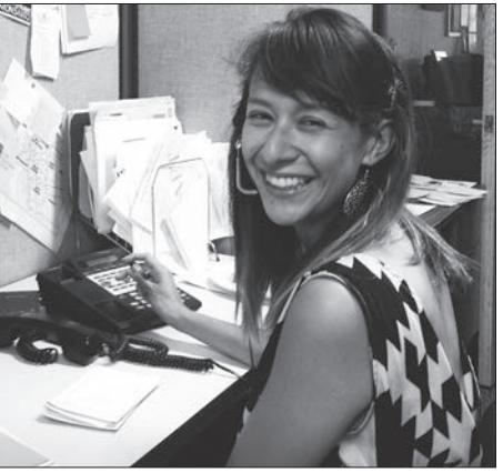
Join the team alongside Membership Outreach Representa-

The Bay Chapter is looking for a Membership Outreach Representative to join our team. Responsibilities include contacting our members during evening phone banks to educate them on our issues, raise money, and identify volunteers. The ideal applicant will have excellent communication skills, be interested in fundraising, and have a passion for environmental issues. Learn more and apply at <a href="http://tinyurl.com/chapteroutreach">http://tinyurl.com/chapteroutreach</a>.