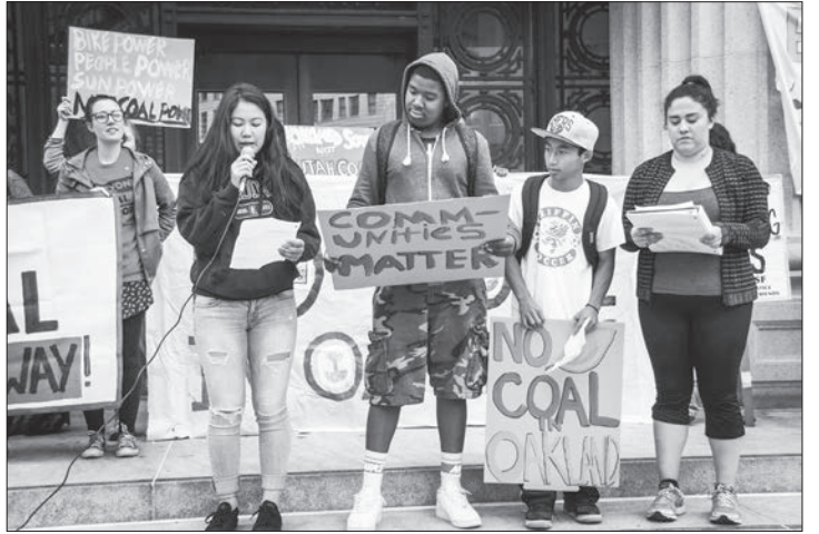
Youth leaders from West Oakland at a rally against bringing coal to Oakland

Oakland's City Council has the power to keep coal out of Oakland Global through a clause in the original development agreement that states that the City can further regulate the development if they "determine based on