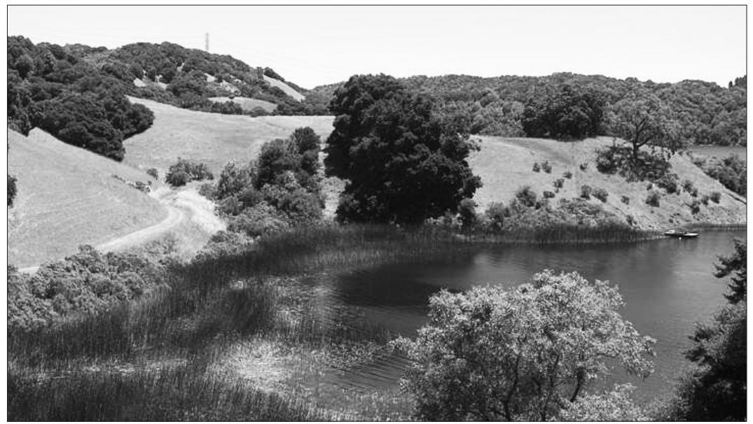
Oursan Trail and Briones Reservoir.

When the District last revised its Watershed Master Plan in 1995, a Citizens Advisory Committee studied the issue of whether to