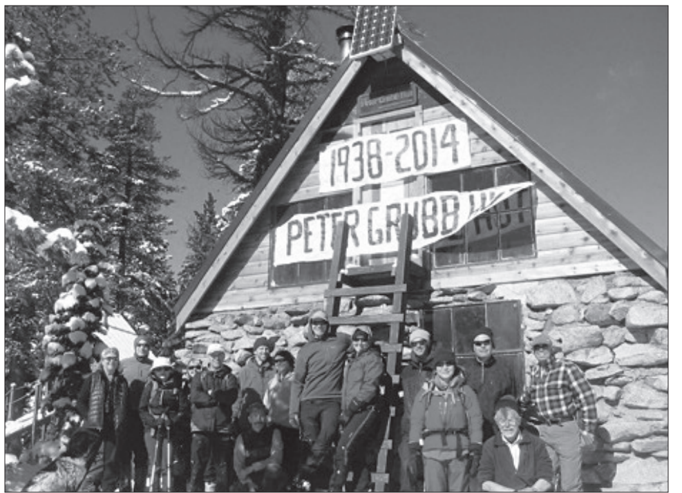
Volunteers at the Peter Grubb Hut as structural repairs neared completion in November 2014.