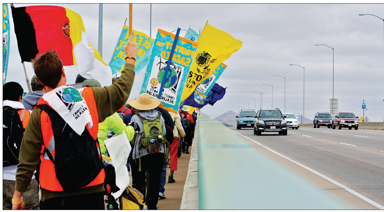
Refinery Corridor Healing Walk marchers bring attention to the health risks and dangers posed by local refineries.

Know your solar options and be the brightest home on the block! Request a solar quote today at sierraclub.org/solarhomes or call (855)438-7860 to speak with our solar homes coordinator.