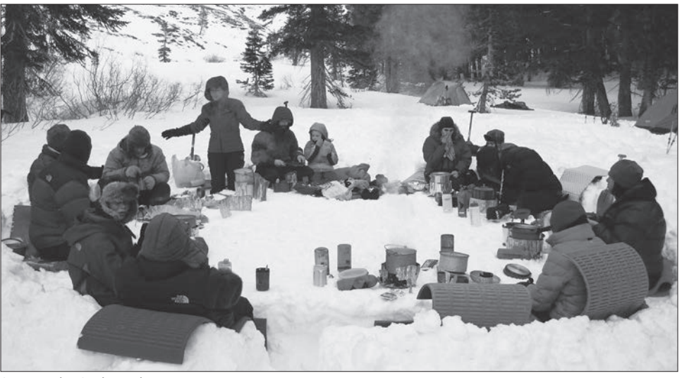
Snowcamping Section outing

The early bird application due date is November 30th; the final due date is December 20th. The full-day classroom training is January 9th. Trip dates vary by group. Sign up early to select dates that work for you and get the early bird discount. A limited number of scholarships are also available. For more information and to sign up, visit our web site at www.snowcamping.org or call Anne at (510)526-6792.