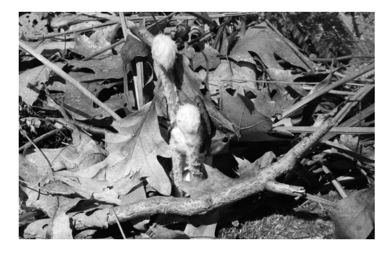
Fern unfurling April 28th

If you are a member of an organization in our area and would like to explore a collaboration with the Crossroads Group of the Sierra Club, we would love to hear from you. Please contact us at: cg@michigan.sierraclub.org