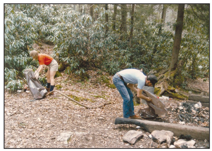
The Chapter's first Service Outing involved a major clean-up of garbage near High Falls of the Cheat, in April 1985. The group hiked along the railroad track from Glady to the work site, and ended up filling 20 or so garbage bags with all kinds of stuff. The Forest Service arranged for bag pickup near the railway.

Yes, we were able to enjoy the forest together, too, and those were very fun times. But when I think of Jim, I think of making a difference, about fighting for what's right. Cheers to Jim and the Mon!