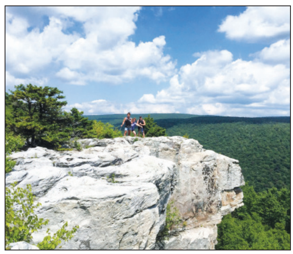
Sierra Clubbers stand atop the Lion's Head at Dolly Sods, on a July outing.

Find out more about why we must stop this pending power plant transfer by visiting <u>http://www.sierraclub.org/west-virginia/</u> <u>firstenergy-fact-sheet</u>.