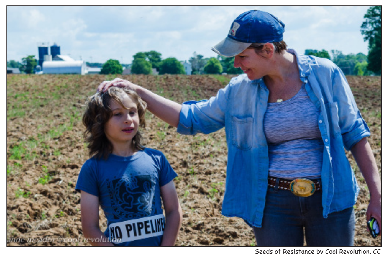
Augusta County, Va., No ACP group has been catalyzing community action and awareness.

Both hearings saw a similar mix of concerned local citizens and industry personnel. It is now left to the state Department of Environmental Protection whether to issue the 401 water-quality certification permit, or not.