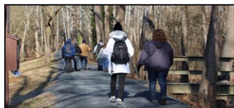
29 Sierrans brought in New Year 2020 with a hike on the C&O Canal towpath from Antietam Aqueduct to Pack Horse Ford (near Shepherdstown).

Additional information: Park admission or permit is required.