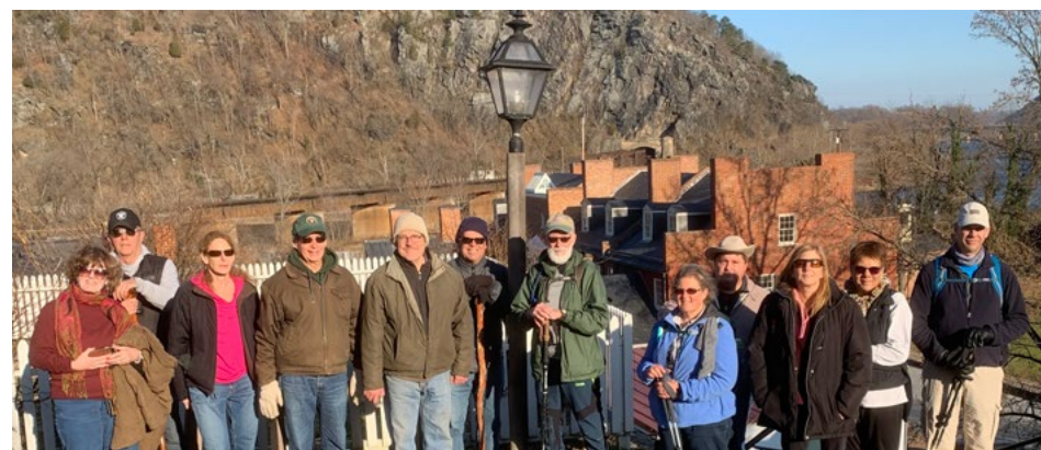
On the final day of Olde Tyme Christmas in Harpers Ferry, thirteen Sierrans hiked some of the Park and town. Shortly before the hike's end, the group gathered for a picture with a view of Maryland Heights in the background.