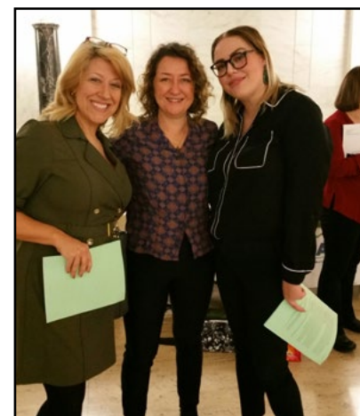
Above: Citizen lobbyists for the Eastern Panhandle.

Throughout the day, volunteers distributed literature and spoke with legislators and representatives from fossil fuel industries who visited our display tables. Others attended committee meetings to get informed about the current status of bills. Two groups met with representatives of the WV Department of Environmental Protection (WVDEP), discussing concerns with permitting and inspection practices. Some attendees browsed through WVDEP's display in the House Rotunda.