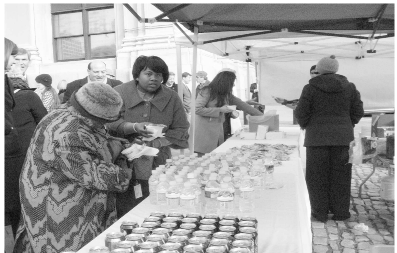
Getting a steaming bowl of Virginia Oyster Stew, (photo lmuller)

By midmorning many participants headed over to the general assembly building to meet with their elected officials to discuss the important clean water bills. An early lunch was served outdoors near the General Assembly building where many lawmakers were greeted to a steaming bowl of Oyster Stew made from native Virginia oysters.