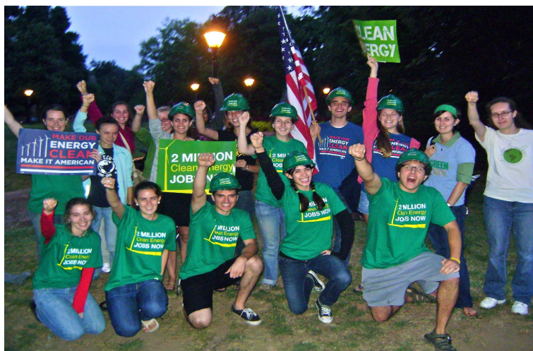
"Clean Energy -Bright Future" Rally, Hurkamp Park Fredericksburg 9/17/09

From Wangari Maathai's Nobel Lecture, delivered in Oslo, December 10 2004.