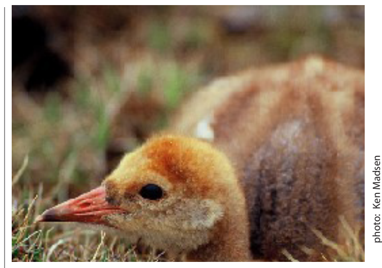
Sandhill crane chick (called a "colt") in the Arctic Refuge

(202)224-3121 to be connected to your member's office. •