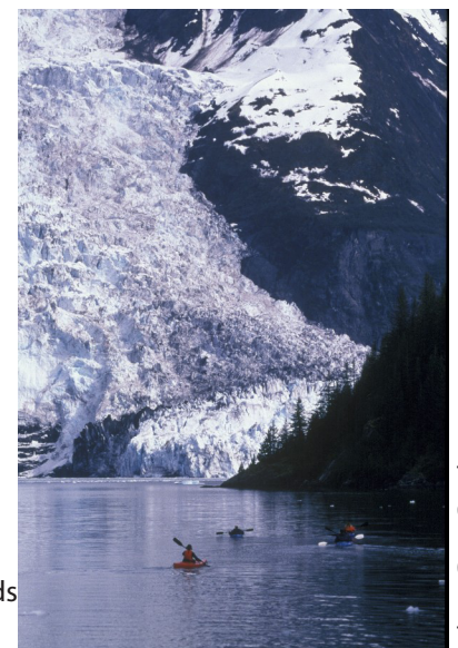
Prince William Sound, Chugach Forest

additional programs including salmon mural art project by children; Ship Creek silver salmon derby; salmon scavenger hunt; Ship Creek restoration tour; Russian/Kenai River restoration work day; salmon marathon; and more.