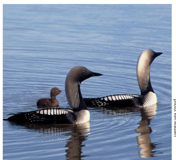
Loons migrate between the Arctic Refuge and the Lower 48