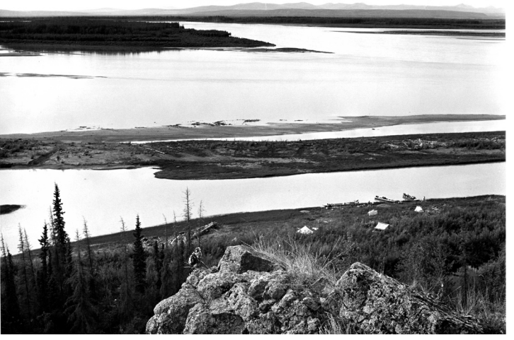
Falcon on the rocks overlooks the Yukon Flats

This proposed land exchange between the U.S. Fish and Wildlife Service and Doyon Ltd., an Alaska Native regional corporation, is on a fast track for approval in August--with the goal of facilitating massive development of underlying oil reserves. (See alaska report , Mar 2008.)