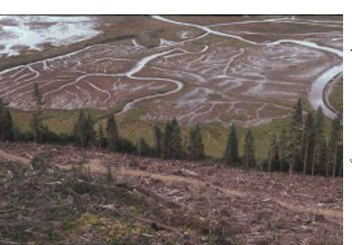
Sealaska's logging practices

environmentally friendly business practice. But it is unlikely that ongoing mills would want to or be able to do such a change. The $40 million in grants would be used to ramp up the Tongass timber industry. The bill does not require