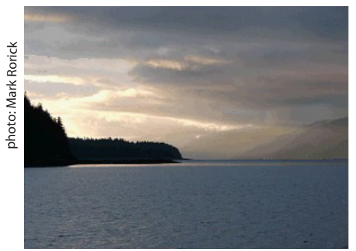
View from entrance of Hoonah Sound into Chatham Strait where many roadless areas are on the Forest Service's chopping block

The good is that a bill reinstating the national Roadless Area Conservation rule, with the Tongass National Forest included in it, is poised to move ahead in Congress. Sen. Maria Cantwell (D-WA) and Rep. Jay Inslee-(D-WA1) are likely to introduce the bill in both houses of Congress