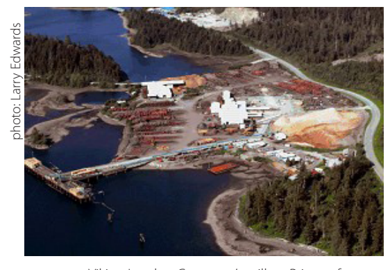
Viking Lumber Company's mill on Prince of Wales Island has done more harm to the Tongass Forest over the last decade then all the other mills combined

has stated publicly that they would like to use the