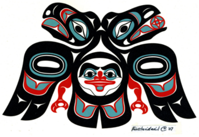
Lovebird © Israel Shotridge

Coal companies see the resulting fallen domestic demand as an opportunity to capitalize on lucrative foreign markets to sell their dirty fuel. They spend their profits inundating the airwaves with their misleading propaganda rather than truly cleaning up their messes and avoiding unnecessary risks to public health and environmental degradation. Unfortunately their misinformation and influence reach beyond the media to Congress and often prevent an