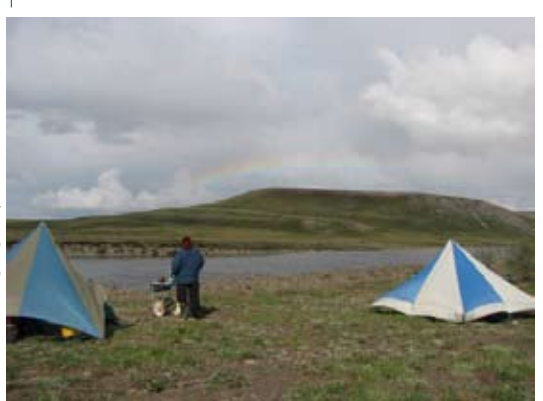
Onshore in the Western Arctic, camping at the Kokolik River

Stay tuned for announcements for the anticipated new plans for the Refuge and Western Arctic Reserve. We will work hard to make sure the Arctic Ocean is not the stage for another drilling farce next summer. We will