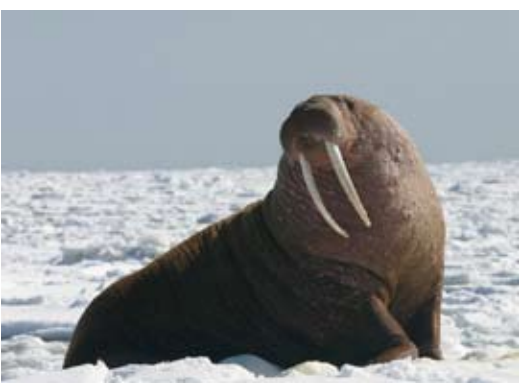
Offshore: walrus and other marine wildlife at risk

The ever-changing Arctic had a busy year in 2012, and still faces ever more challenges to come. Summer of 2012 saw the smallest amount of sea ice ever. Also during summer of 2012, Shell Oil brought two drill rigs into the Arctic Ocean; other shipping traffic increased as well, taking advantage of ice free waters. While the coastal seas were seeing so much potentially damaging activity, hope increased that onshore the public lands in the Arctic – both the Arctic National Wildlife Refuge and the Western Arctic (NPR-A) -- might see the most protections in decades. Let's