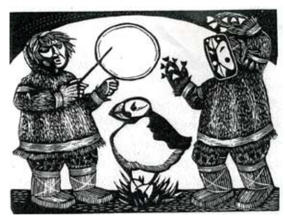
Puffin Dance © Dale DeArmond

pets who tend to put any small items in their mouths. Upon examination of the plant seeds listed on the packet of the company's special mix, we learned one of the plants was Rangeland Alfalfa (medicago sativa) which is an officially recognized invasive plant in Alaska and a specific problem in the Seward area, where the Park Service and local non-profits have been trying to eradicate it from Alaska's prized Kenai Fjords National Park -- as it had taken hold along the road and trail to Exit Glacier. Two other species in the mix are being considered for official invasive status as well. This packet of seeds was the only item in the goodie bags that came with any instructions. The directions on the bag encouraged students to dig up a patch of the lawn in their family yards and plant the seeds.