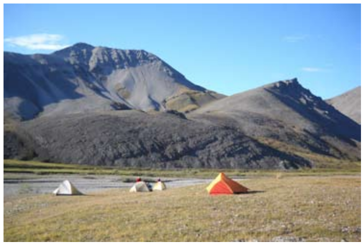
Tents on the tundra--western Arctic

My 2012 trip is entitled "Foliage, Fish, and Berries in the Western Brooks Range". This is its third year and follows a number of earlier trips in the same general area. Our timing coincides with the peak of the tundra fall foliage when the dwarf birch forming the basic fabric of the shrub tundra turns a blazing orange-red. The colorful tundra mosaic is dotted with alleys of yellow willow in the drainages and patches of deep red and purple where blueberry and bearberry hold forth on the drier slopes. These hues are offset by the silvery gray of frost-shattered rock outcrops. The jagged peaks and rocky spires lining ridges often remind the viewer of a stegosaurus backbone. This is the unexpected result of the arctic climate, where the most recent glacial advances could not