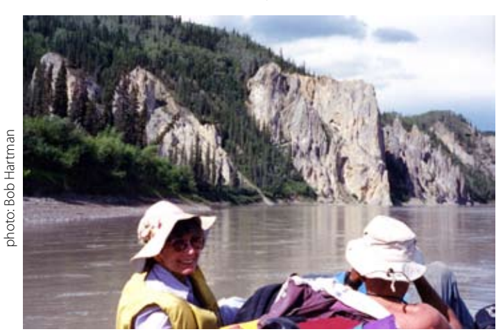
A 2002 Alaska Chapter outing rafts the Yukon River in Yukon-Charley National Presereve; passing Tahoma Bluffs

The lawsuits are a reaction to NPS law enforcement on the Yukon River as it flows through the Preserve. When park rangers attempted a boat