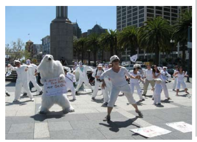
San Franicisco polar bear dance party -- on the Embarcadero, April 28, 2012

Just two weeks later, on May 15 at a Million Mobilization march in Washington, DC, many DC residents saw a rare sight—arctic animals walking the streets of the capital. More than a hundred activists joined the ranks with