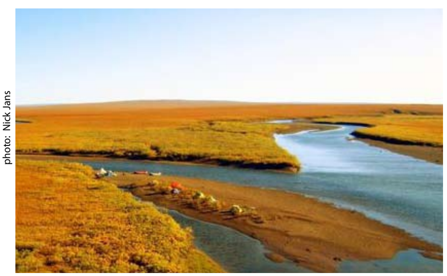
Camping at the Kokolik River, Western Arctic

In early February the Department of the Interior issued a Record of Decision that formally adopts a new Integrated Activity Plan for the National Petroleum Reserve-Alaska (Reserve). Located on Alaska's North Slope and almost 23 million acres in size, the Reserve is our country's largest single unit of public land. The final plan appropriately protects five unique Special Areas in the