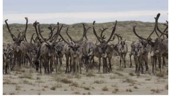
Caribou near Teshekpuk Lake, Western Arctic

Don't let the name confuse you, the enormous National Petroleum Reserve-Alaska (the Reserve) harbors abundant wildlife, flowing rivers, vast stretches of Arctic tundra. The Reserve is home to half a million caribou, millions