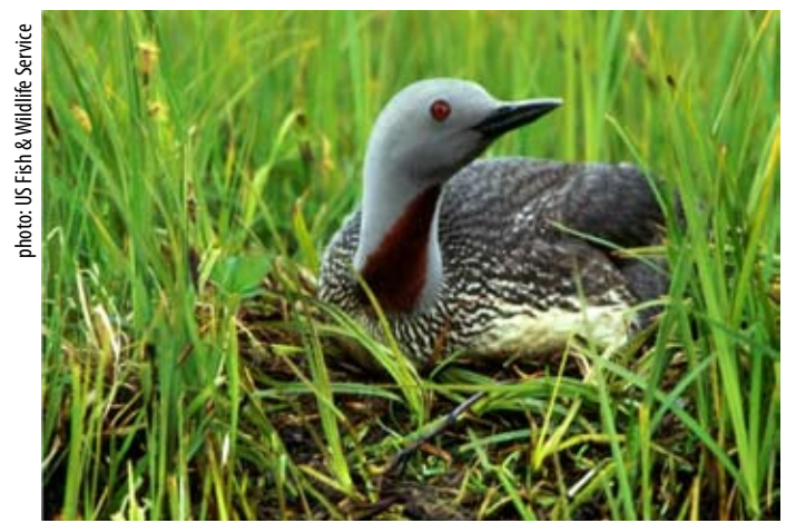
Red-throated loon, one of myriad bird species in Western Arctic Reserve

The new Alternative B-2 is a variation of the original B in the draft plan released by BLM this past spring. (See Sierra Borealis June 2012.) Under Alternative B-2, three of the six previously existing "Special Areas", noted for their extraordinary biological or geological resources, are expanded in size, and one new Special Area is established. The Special Areas--Colville River, Utukok Uplands, Teshekpuk Lake, Kasegaluk Lagoon, Dease Inlet-Meade River, Peard Bay, and DeLong Mountains—total 13.35 million acres and of that, 11 million acres is barred from oil and gas leasing. There are still improvements we hope for in the final plan, such as including Wild and Scenic River recommendations from some management alternatives, but overall the preferred alternative goes in the right direction.