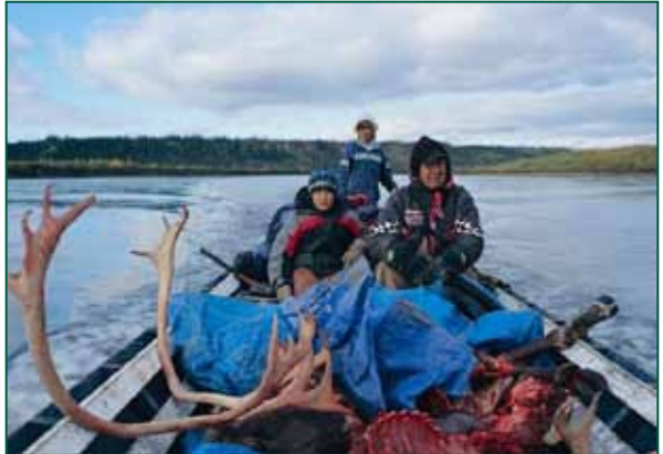
A Gwich'in family on the Porcupine River near Old Crow, Canada

The Gwich'in people of Alaka and northwest Canada have staunchly opposed opening the Arctic Refuge to drilling for the significant damage it would cause to the Porcupine caribou herd, which uses the 1002 Coastal Plain area as its calving ground. Their traditional subsistence livelihood depends on the caribou. They follow the caribou--which winter in the watershed of the Porcupine River in the Canadian Arctic and come to the coastal plain of the Refuge to give birth to their calves and nourish them in summer. The sea winds off the Arctic coast give them needed relief from mosquitos and other summer biting insects.