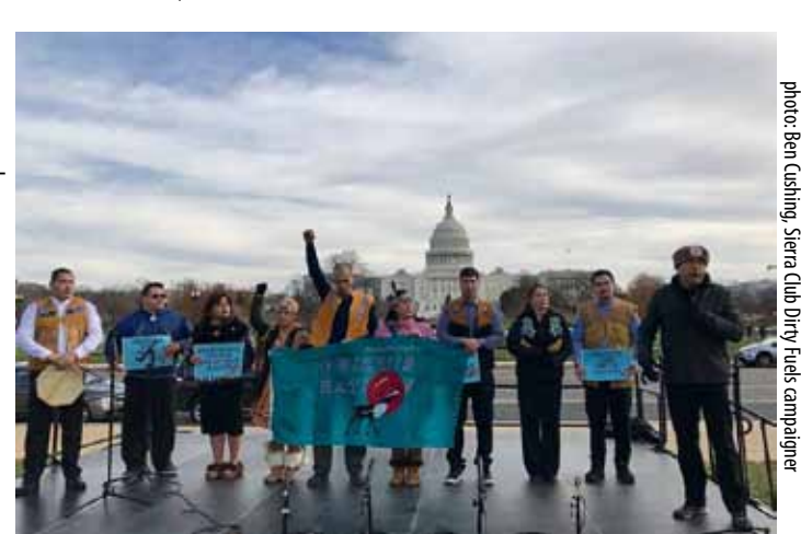
Members of the Gwich'in Nation of Alaska and Canada in Washington, D.C. at a pray-in on Capitol hill. led by the Gwich'in Steering Committee and the Indigenous Environmental Network.