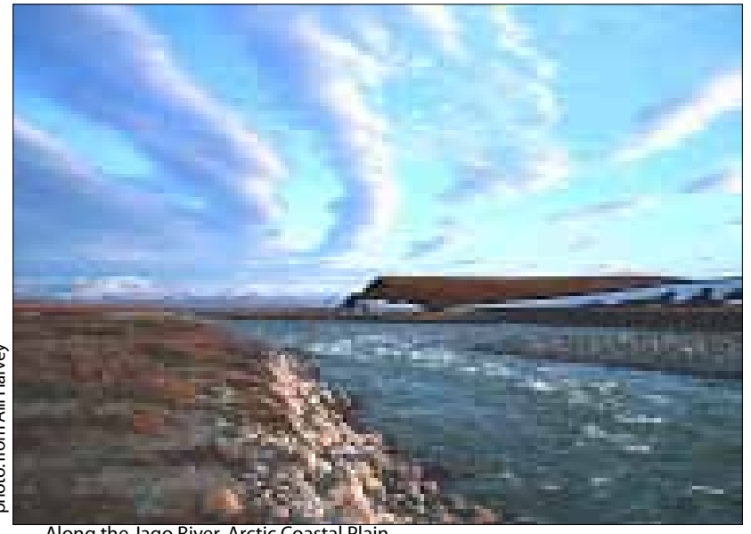
Along the Jago River, Arctic Coastal Plain