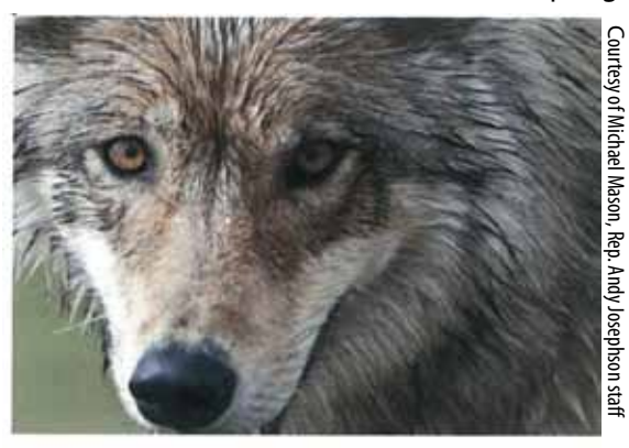
Denali Wolf.

opportunity for half a million visitors to Denali Park to view wolves. (sierra borealis, Dec 2013) The economic value of living wildlife to the state of Alaska far exceeds the value of wolf pelts, bear hides, etc. In 2011, wildlife viewing activities supported more than $2.7 billion of expenditures--twice as much as the $1.3 billion provided by hunting activities in Alaska in 2011. Denali National Park contributes over $560 million per year to Alaska's economy. It is the third largest revenue-generating park in the nation.