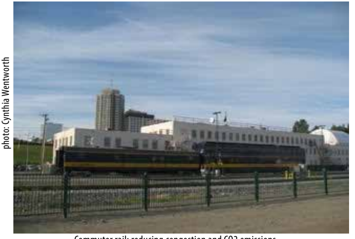
Commuter rail: reducing congestion and CO2 emissions

The Department held public meetings in the Matanuska-Susitna Borough as it developed the State Rail