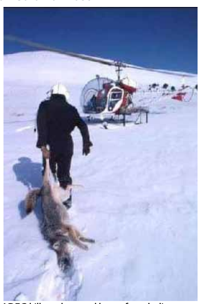
ADFG kills wolves and bears from helicopters: very expensive "intensive" management