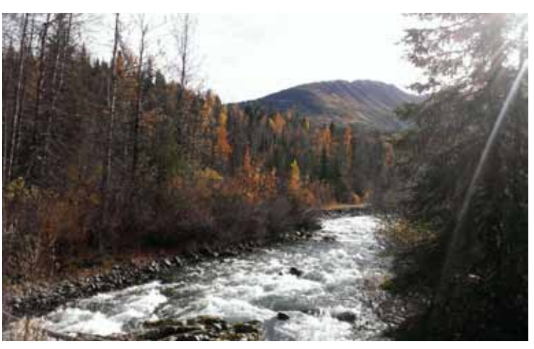
Last outing of 2016--to Manitoba