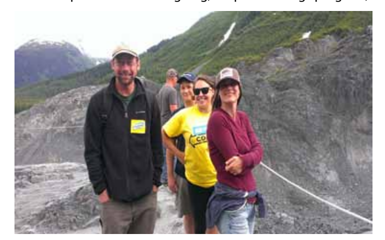
Hike to Exit Glacier after Mt Marathon July 4 event tabling

The new executive committee members all agreed on the importance of an ongoing, frequent outings program,