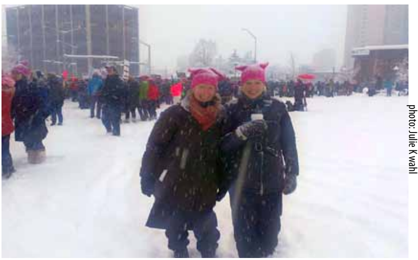
In Anchorage, at the January 29 Women's March

The Alaska Chapter had a presence at the January 29 Anchorage Women's March -- participating in both the march as well as representing the Sierra Club at the follow-up event at The Williwaw. This was a very exciting occasion with an incredible turn out and so many people interested in furthering their commitment to take action to protect Alaska's unique wild environment.