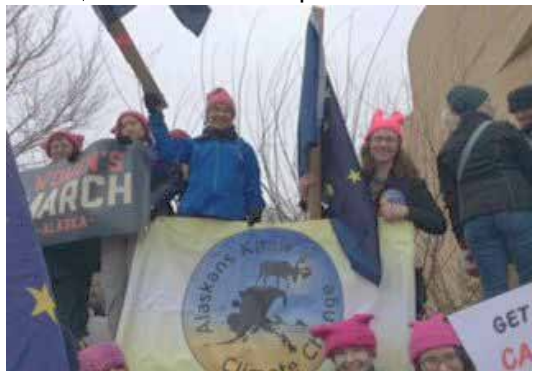
DC Women's march photo from Valanne Glooschenko

Alaskans were also well represented in the biggest January 29 Women's march – the one held in Washington DC. As many as 600 Alaskans were present to participate in the big solidarity event in the nation's capital.