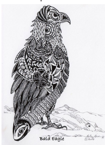
Betsy Bear Creations, North Pole AK

The experiences extend from the early 1980s to cur-