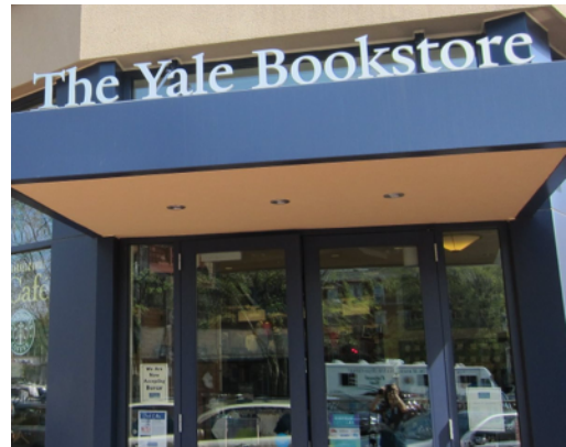
Energy Committee Planning Site