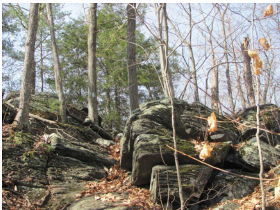
Rugged Terrain at Ledges