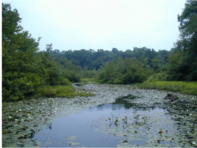
Save Branford River

The biggest environmental issue in our Shoreline community is in Branford. At issue is the proposed commercial development of a 44 acre parcel of land known as the Costco project at exit 56, at the I 95 interchange. The project involves the construction of a Costco store, room for 1200 cars on 22 acres of paved surface, a 16 pump gas station and seven additional buildings, most likely retail.