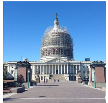
U.S. Capitol, Washington, D.C.