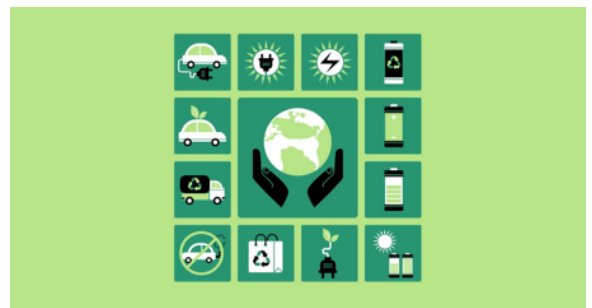
Discover Renewable Energy