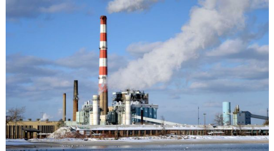
The Bridgeport Harbor Station

There are currently five states in the US that no longer have any coal plants (ME, VT, RI, ID and CA). The next state to retire a coal plant is Massachusetts. It's Brayton Point and is set to retire in 2017. Happily, Connecticut is joining the list.