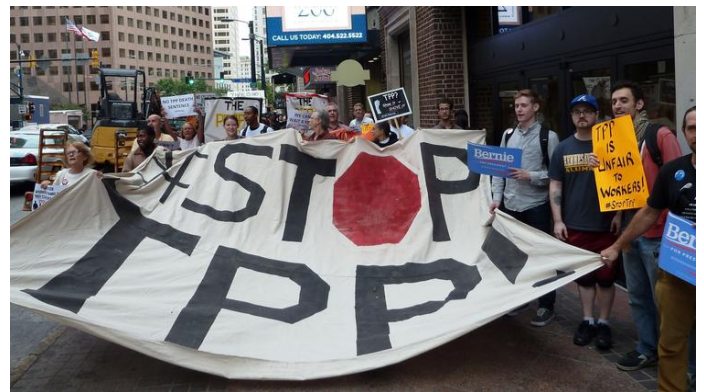
Protestors call for the rejection of the Trans-Pacific Partnership trade deal under negotiation.

Indeed one of the most condemning features of the TPP is its failure to even mention climate change or the United Nations Convention on Climate Change although all TPP countries are subject to this Convention.