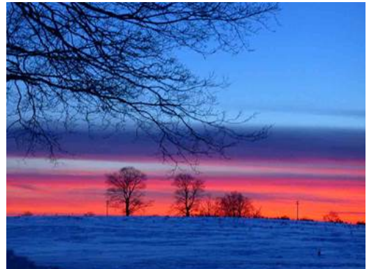
Smoky Purple Winter Palette