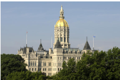
CT State House, Hartford