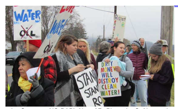
La Crescent NO DAPL Nov. 15

The session was scheduled to last from 5 to 7 p.m. but went to 8:15 p.m. so everyone could speak. The EPA administrators thanked the group for their comments and said that this kind of session was a big help to them in doing their jobs.