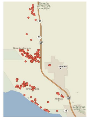
Nitrate > 10 mcg/mL Spring 2017

Watch for more details in our December newsletter. In the meantime, if you have a private well, get it tested! And view handouts, maps, and other forum materials at cr-sierra.blogspot.com/p/groundwater-pollution-forum-october-24.html