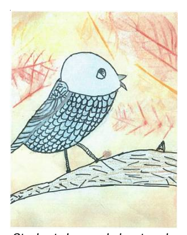
Students learned about and drew birds thanks to a CRSC environmental ed grant.

For spring 2022, CRSC will offer grants of up to $200 each for environmental education projects to schools or community organizations involving young people at the elementary and middle school level within the CRSC region: Crawford, Grant, Jackson, La Crosse, Monroe, Richland, Trempealeau, and Vernon counties.