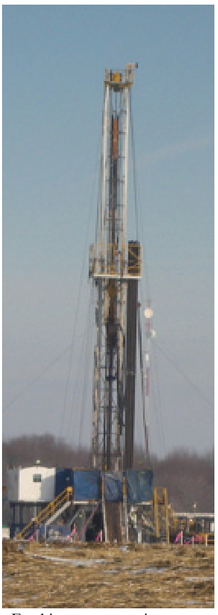
Fracking tower coming to a field near you?