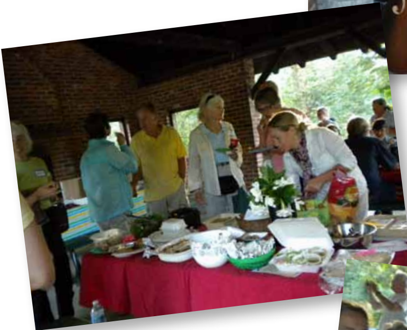
Local Food Celebration