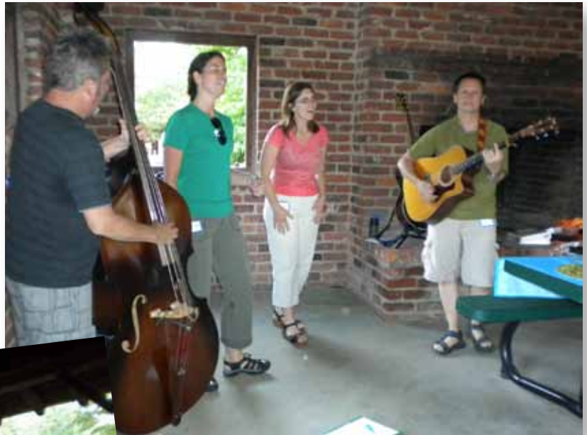
Haze and The Transients

Transients . Good friends, good food, good music, good weather – a great time was had by all! Thank you, volunteers!