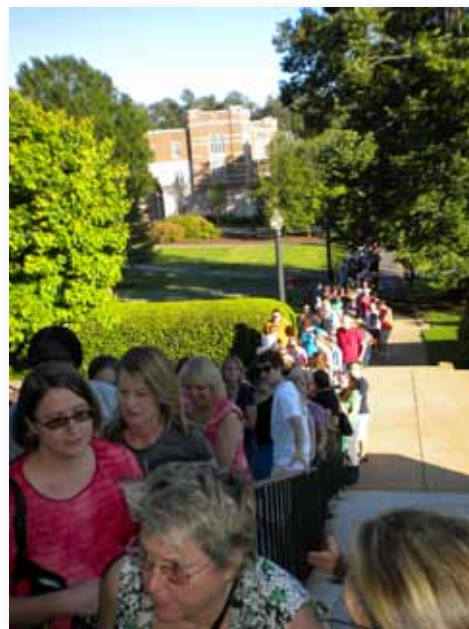
Line outside Old Gym for BYS

What a fantastic effort! CONGRATULATIONS !!