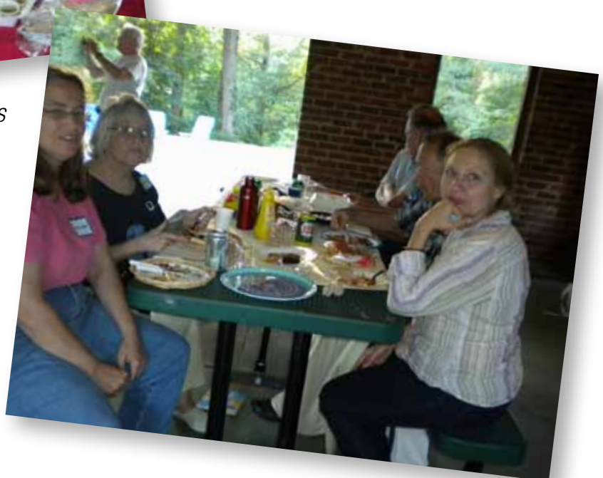
Happy Campers!