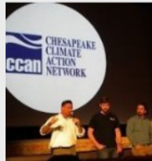
Sponsors were honored at 2016 RVA Environmental Film Festival.