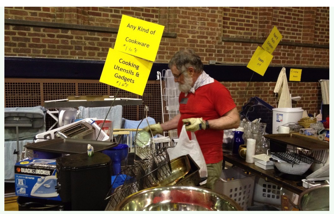
Volunteers Needed Before the Sale

Join in to prepare for FOJG's 19th Big Yard Sale (BYS), a joint project with University of Richmond. Last year's BYS was a great success in every way: rescuing departing students' discards, diverting this good stuff from the landfill, having good fellowship, and generating over $10,000 to be shared by the Sierra Club and UR Green!