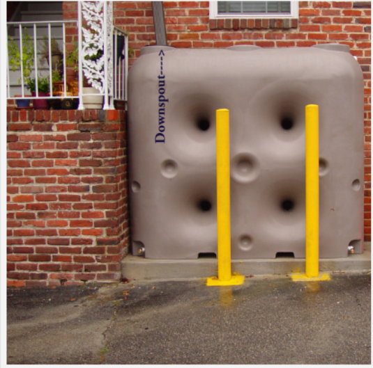
Cistern collects rain water from apartment roof