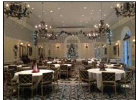
Robins Room during GardenFest