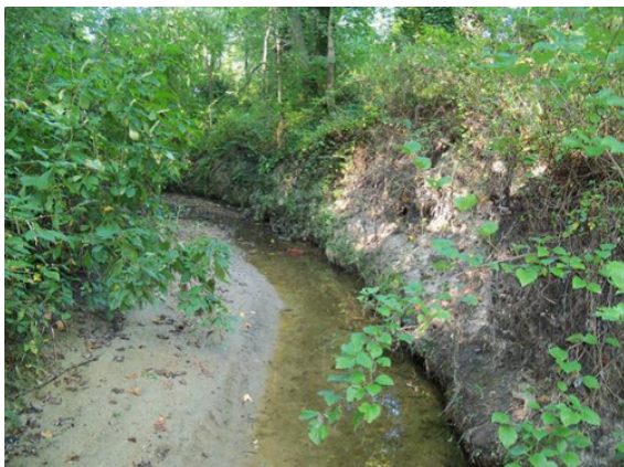
Eroded Stream Bed