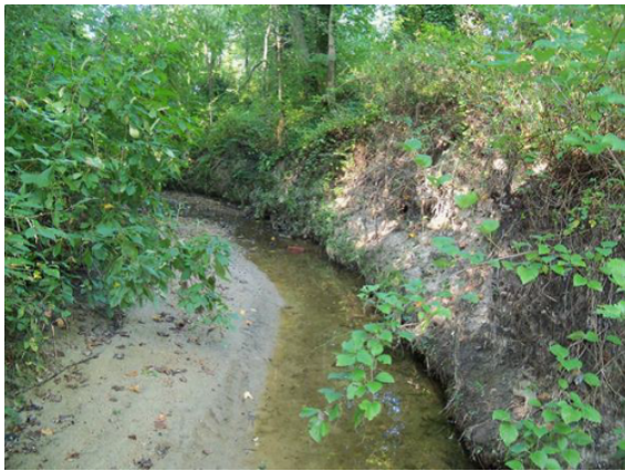
Eroded Stream Bed