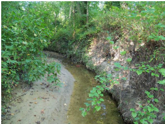
Eroded Stream Bed