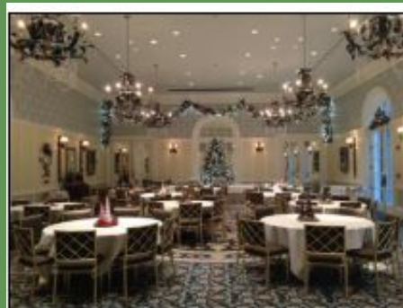
Robins Room during GardenFest