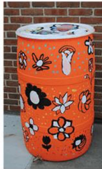
Oak Grove E.S.