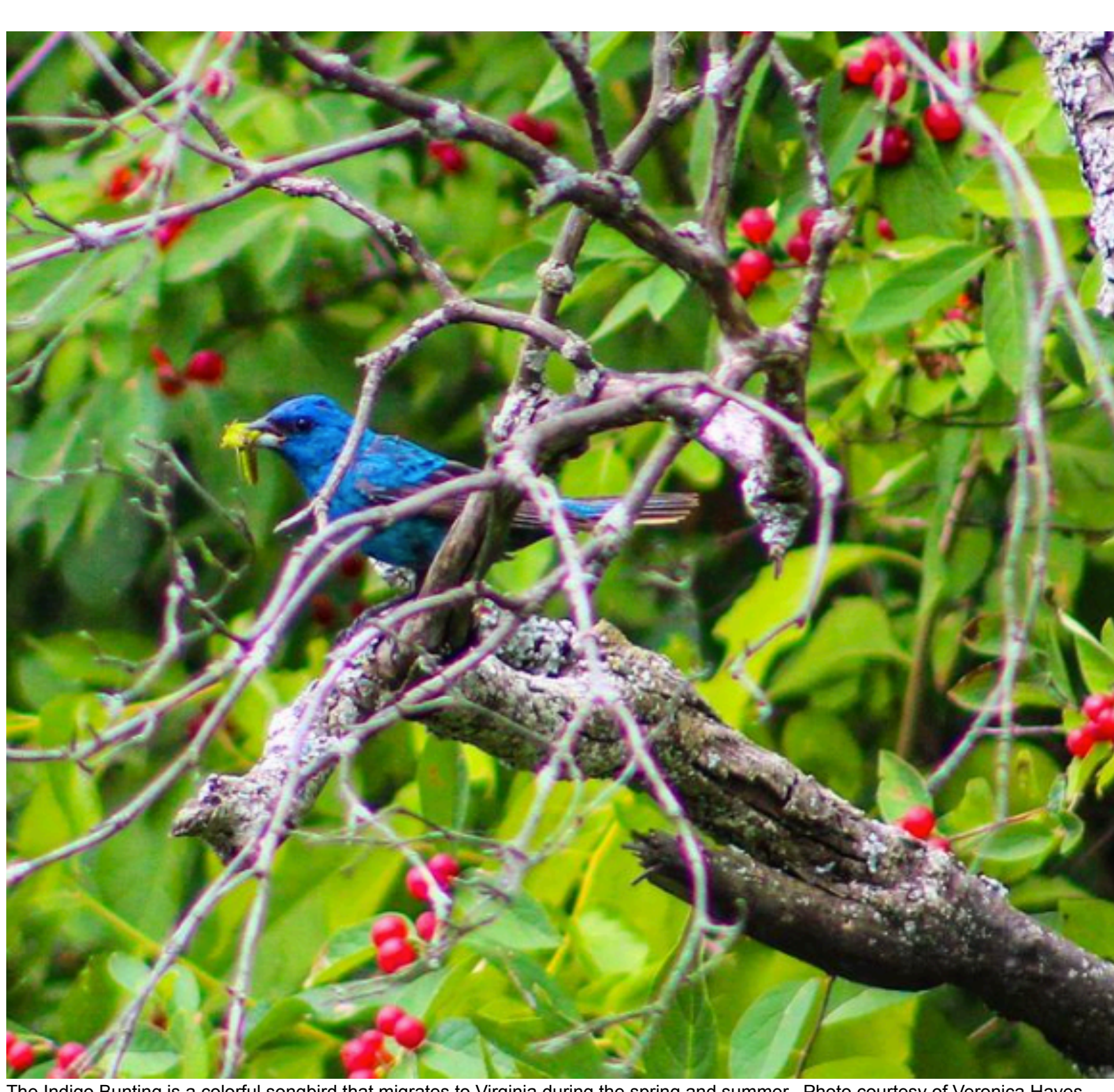
The Indigo Bunting is a colorful songbird that migrates to Virginia during the spring and summer.