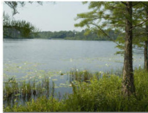
Laura S. Walker State Park

Okefenokee is one of the world's largest naturally driven freshwater ecosystems with a diversity of habitat types, including 21 vegetative types. The Refuge's fauna is also renowned worldwide for its diversity of amphibians and reptiles, mammals, birds, fishes, and invertebrates and perhaps as many as 1,000 species of moths. Unlike many other significant wetland areas, the swamp is the source of rivers rather than their recipient, as in a delta, and therefore escapes most disturbances to natural hydrology and water flow. The Refuge's undisturbed peat beds store valuable information on environmental conditions over the past 5,000 years and are a significant source of information related to global changes.