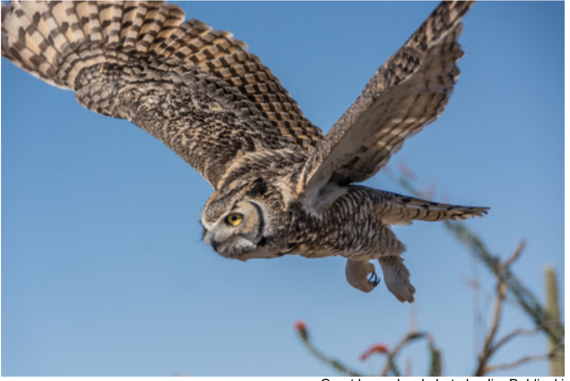
Great horned owl