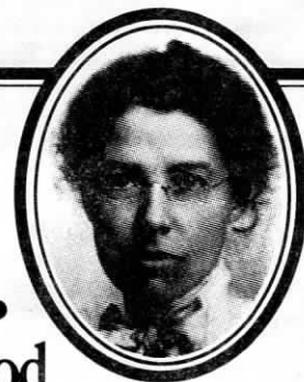
William E. Colby Memorial Library

"Because of her, wild flowers lead a safer life, forests tower more grandly skyward, and many learn again the ancient lesson as they look toward the mountains with eyes that see and hearts that understand."