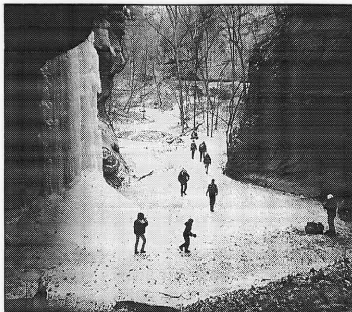
From 1996: HOI Starved Rock winter hikers check the ice formations in Tonti Canyon where they stopped for lunch under the frozen waterfalls.

Questions? - Al Harkrader, (309) 682-8462