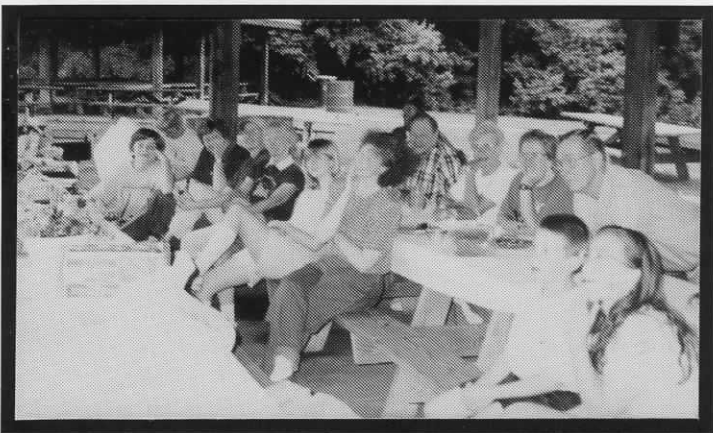
HOI Sierrans and guests bid for items during the white elephant auction at this year's potluck picnic at Detweiller Park.