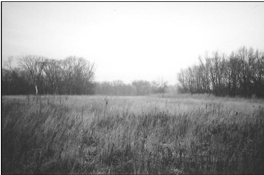
Site of planned horse camp at the center of Jubilee State Park, just east of the park office and across the road from the main picnic areas.