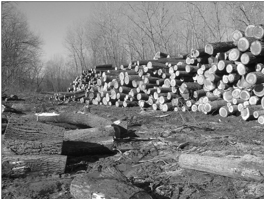
Logged trees on the proposed Banner strip-mine site.