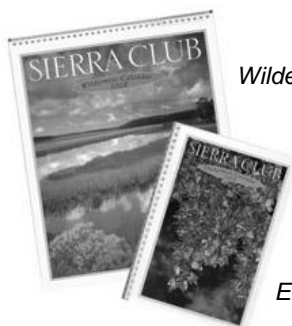
Wilderness Wall Calendar ($12.95)