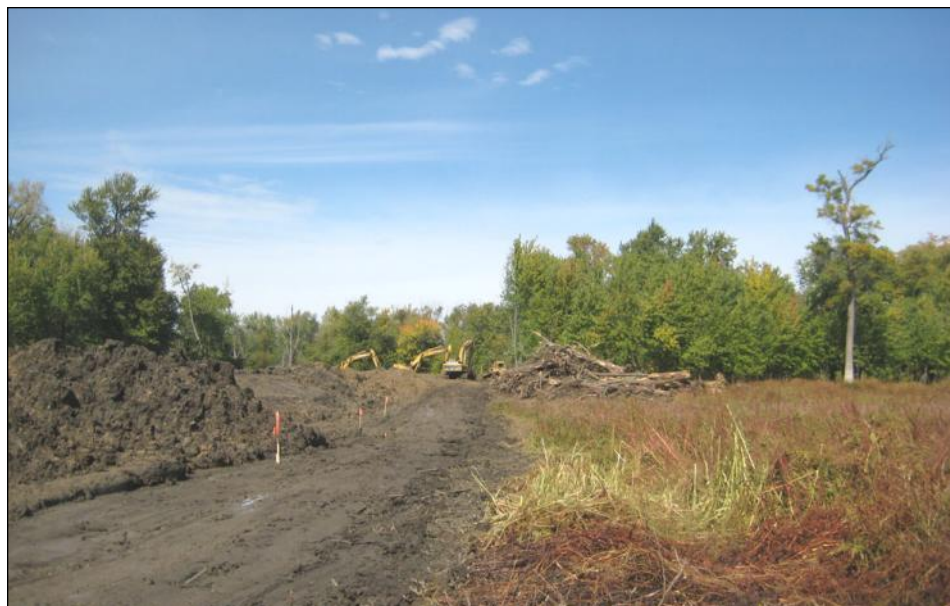
Army Corps tree cutting for water ditch near the eagle roost at Rice Lake - Oct 6, 2012.